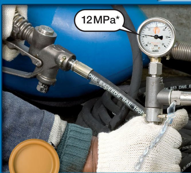
High Pressure Air Pump & Jackpots