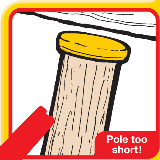
Pole too short!