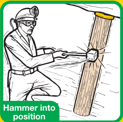
Hammer into position