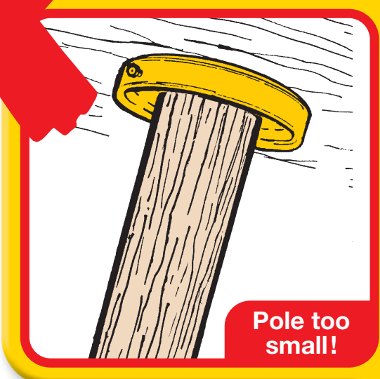
Pole too small!